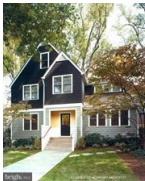
1 / 13

MLS #: 1000224942 Status: Closed Property Type: Residential Tax ID: 160700504393 School District: Montgomery County Public Schools Subdivision: Glen Echo Heights Central Air: Yes Heating Type: Forced Air Garage/Parking: On Street Parking