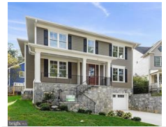
1 / 30

MLS #: 1001007241 Status: Closed Property Type: Residential Tax ID: 160700506016 School District: Montgomery County Public Schools Subdivision: Glen Echo Heights Central Air: Yes Heating Type: Forced Air, Programmable Thermostat Garage/Parking: Attached Garage, Driveway Parking, Off Street Parking, 1-Car Garage, 1 Attached Garage Spaces, Garage Door Opener, Garage - Front Entry, 1 Total Garage and Parking Spaces, Paved Driveway