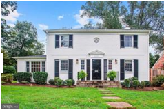
1 / 22

MLS #: 1003852252 Status: Closed Property Type: Residential Tax ID: 160700503935 School District: Montgomery County Public Schools Subdivision: Glen Echo Heights Central Air: Yes Heating Type: Forced Air Garage/Parking: Off Street Parking