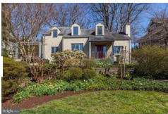
1 / 29

MLS #: 1000347202 Status: Closed Property Type: Residential Tax ID: 160700507738 School District: Montgomery County Public Schools Subdivision: Glen Echo Heights Central Air: Yes Heating Type: Forced Air Garage/Parking: Attached Garage, 1-Car Garage, 1 Attached Garage Spaces, 1 Total Garage and Parking Spaces