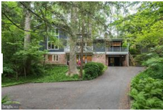
1 / 29

MLS #: 1001746644 Status: Closed Property Type: Residential Tax ID: 160700503070 School District: Montgomery County Public Schools Subdivision: Glen Echo Heights Central Air: No Heating Type: Forced Air, Heat Pump(s) Garage/Parking: Attached Carport, Off Street Parking, 1 Attached Carport Spaces, 1 Total Non-Garage Parking Spaces, 1 Total Garage and Parking Spaces