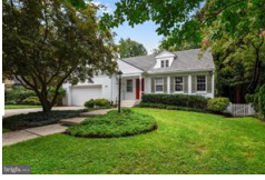
1 / 29

MLS #: 1005951947 Status: Closed Property Type: Residential Tax ID: 160700508790 School District: Montgomery County Public Schools Subdivision: Glen Echo Heights Central Air: Yes Heating Type: Forced Air Garage/Parking: Attached Garage, Off Street Parking, 2-Car Garage, 2 Attached Garage Spaces, Garage Door Opener, 2 Total Garage and Parking Spaces