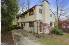
1 / 30

MLS #: 1000423290 Status: Closed Property Type: Residential Tax ID: 160700506040 School District: Montgomery County Public Schools Subdivision: Glen Echo Heights Central Air: Yes Heating Type: Forced Air, Programmable Thermostat Garage/Parking: Driveway Parking, Off Street Parking, Paved Driveway