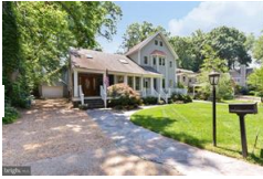
1 / 30

MLS #: 1000150938 Status: Closed Property Type: Residential Tax ID: 16070050570 School District: Montgomery County Public Schools Subdivision: Glen Echo Heights Central Air: Yes Heating Type: Forced Air Garage/Parking: Detached Garage, 1-Car Garage, 1 Detached Garage Spaces, Garage Door Opener, 1 Total Garage and Parking Spaces